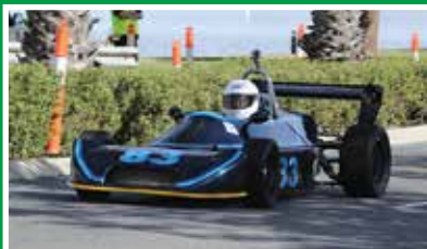
Where Do We Go From Here?