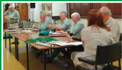
Annual General Meeting