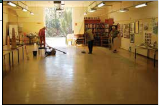
Dad’s Army members work on the clubroom floor

The floor of the meeting room has come in for vigorous cleaning. The whole floor is being stripped by Dad’s Army members ready for sealing before the Annual Dinner.