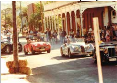
Action from the 1981 York Flying 50

Since its foundation as a one-event club, the VSCC has developed into a leading motor sports club, organising at least two round the houses events every year plus hillclimbs, the Vintage Stampede and race meetings. The Flying 50 has moved from York, where there never was a race