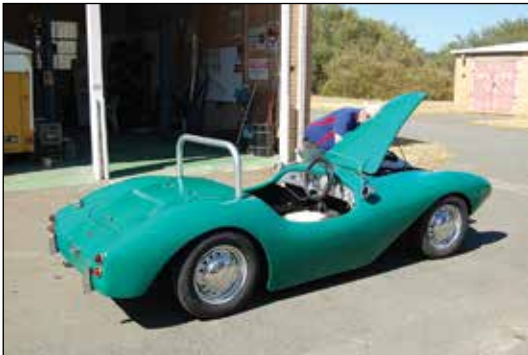
The Caversham Car looking very smart

With all of that the car is now looking very smart and Denny Cunnold is to be congratulated on the excellent finish of the bodywork. Photographs of the cars that were completed in the 1950s show that the VSCC car is much the best finished of the bunch.