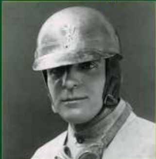
His Final Autobiography

T his autobiography of one of British motoring's most outstanding characters has been in my library for five years. When I bought it the price tag said $19.95 but today Pitstop Online ( www.pitstop.net.au ) has it priced at $49.99 plus $6.95 post and packing.