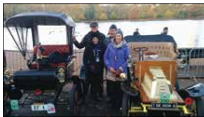
The Oldsmobile and De Dion

Only those who have participated as drivers or crew will appreciate what a great achievement it was for four cars from Western Australia to be shipped to the UK to compete in this event for the first time. All four teams of automobilists should be justly proud of their achievements.