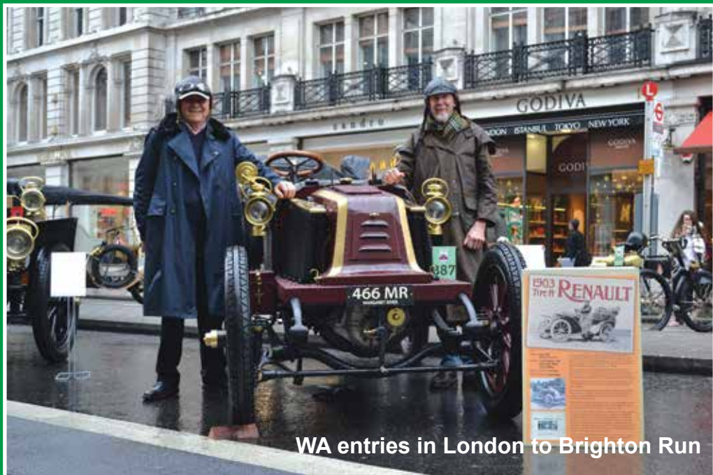
WA entries in London to Brighton Run

Annual Dinner, Awards Night & General Meeting: Monday 4th December 2017