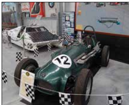
The late Graham Lloyd's HWM Jaguar at the museum in 2017

Graeme Whitehead: Home phone 92791061. Mobile phone 0412919370.