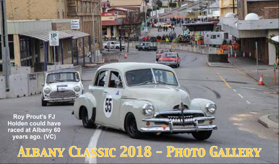
Roy Prout's FJ Holden could have raced at Albany 60 years ago. (VC)