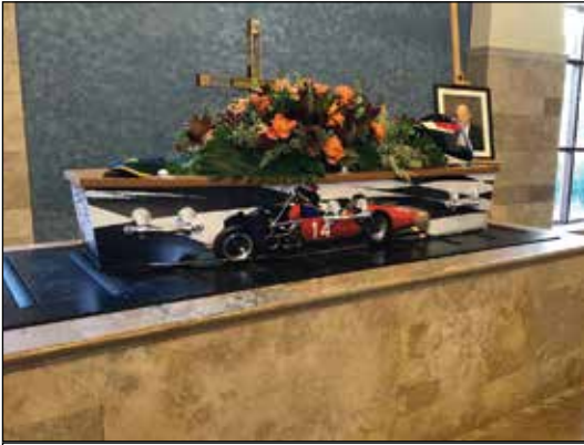
The casket was decorated with an image of Dick in the Triumph Special