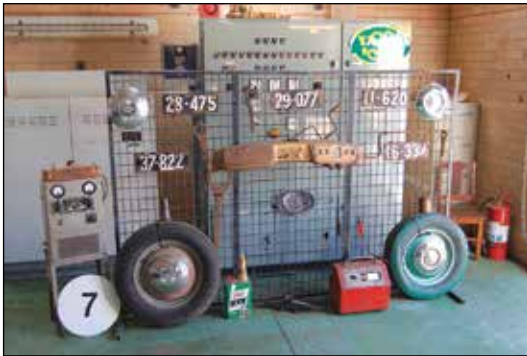
The first display stand for the Old School Workshop. The switchboard behind the stand is the one that can produce unlooked for results.

It was the engine room for the backup diesel generator when the armed services occupied the site and it is still possible to shut off the power to the whole site if you press the wrong button. Dad's Army adopted the room as a machine shop for Peter van der Struyf to perform his mechanical magic, producing parts for the Caversham Car and other Dad's Army projects.