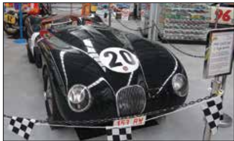
Alan Shephard's beautifully built C-type Jaguar replica at the museum in 2017

Dads Army Xmas in July 2018 will be held at our clubhouse with a visit to the Whiteman Park Motor Museum included. It will be on Tuesday July 24 and the format for the day will be as follows: