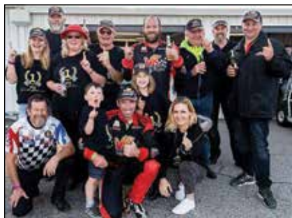
The Martin Family Racing team.